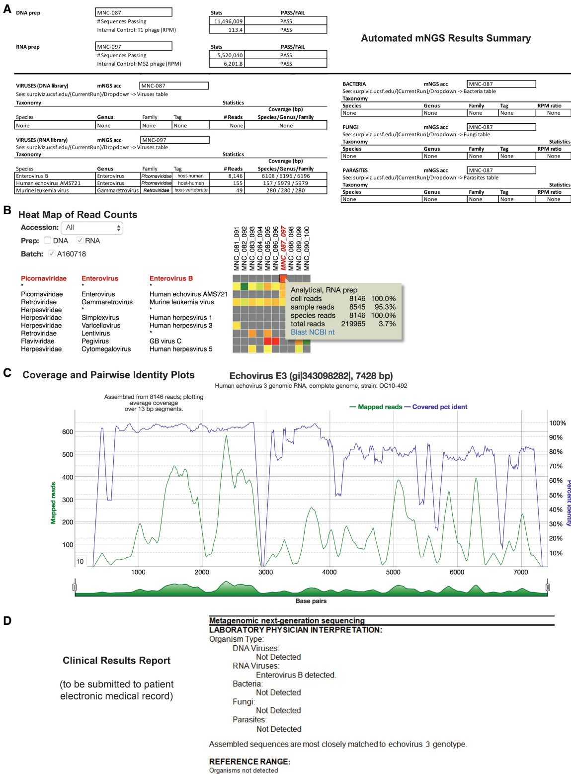
Figure 2. Identification and reporting of enterovirus infection in a patient with meningoencephalitis using a clinical CSF mNGS assay. SURPI+ provides tools to aid clinical interpretation and graphical visualization (the SURPIviz package), including (A) an automated mNGS results summary, (B) a heat map of aligned reads corresponding to detected pathogens, and (C) a coverage plot (green line) of reads corresponding to a detected pathogen that are mapped to the most closely matched genome or gene in the reference database, along with a corresponding pairwise identity plot (purple line, sliding window = 10 nt). Viral hits corresponding to one CSF patient sample (MNC_087_097, column highlighted in red in B) are taxonomically identified as enterovirus (enterovirus B and echovirus AMS721 species) and murine leukemia virus, a known reagent contaminant (Zheng et al. 2011). After an interpretive review, a laboratory physician prepares a clinical results report (D) that is submitted to the patient electronic medical record (EMR).